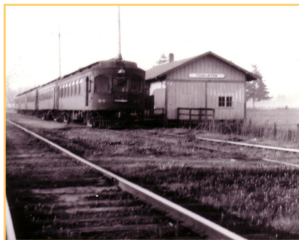
An Oregon Electric passenger train on the alignment in the early 20th century.

Today, Portland & Western Railroad owns the freight line and, in a groundbreaking agreement, provides contract services to the commuter rail project that became WES.