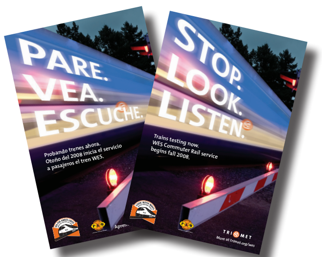
WES safety materials, such as these posters, appeared at public venues along the commuter rail alignment.

In January 2011, a quiet zone and wayside horns became operational along the WES and freight alignment in Tualatin. The quiet zone stretches 2.4 miles and encompasses four crossings, while the wayside horns are installed at four downtown crossings. These train horn mitigations were installed at the request of community members, and funded by WES project partners and the American Recovery and Reinvestment Act.