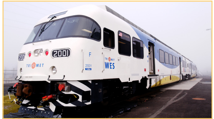
WES service debuted with four diesel multiple unit (DMU) vehicles.

The project also worked to capitalize on the line's